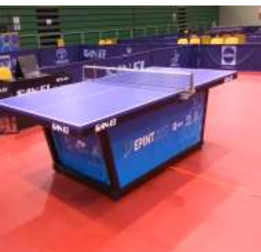
<u>Practice – Training Hall:</u> 12 SAN-EI Tables in each hall with Taraflex flooring,